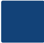
BLUE ME AWAY