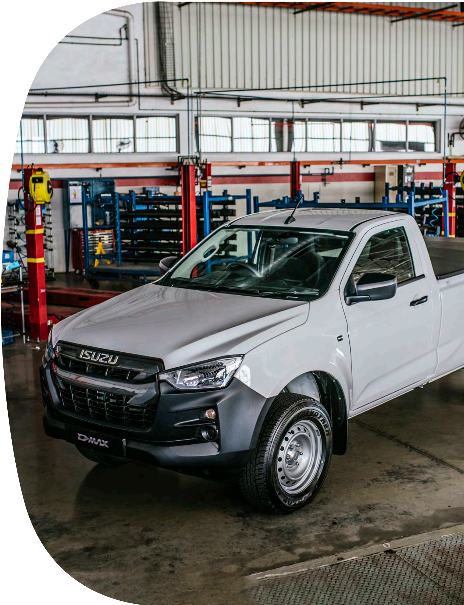
MODEL SHOWN: D-MAX 1.9 Ddi SINGLE CAB 4X4 L