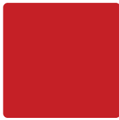
PULL ME OVER RED