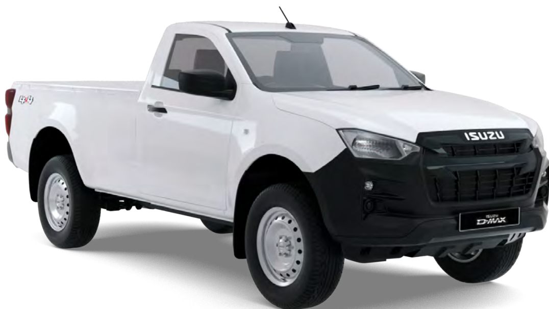
MODEL SHOWN: D-MAX 1.9 Ddi SINGLE CAB 4X4 L